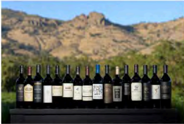
Cabernet Sauvignons from the Stags Leap District Appellation Collection.