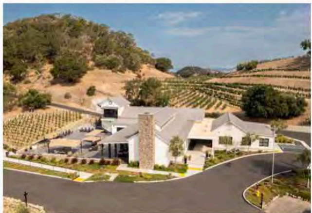
Baldacci Family Winery, Stags Leap District.

I was able to taste four of the wines from the 2019 Appellation Collection. Here are my tasting notes (each of these wines is 100% Cabernet Sauvignon):