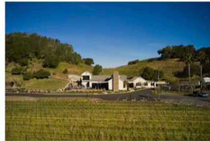
Baldacci Family Vineyards.

In a visual display of sustainability, the rock that was excavated for the cave construction was broken down and disbursed throughout the estate vineyards as landscape material.