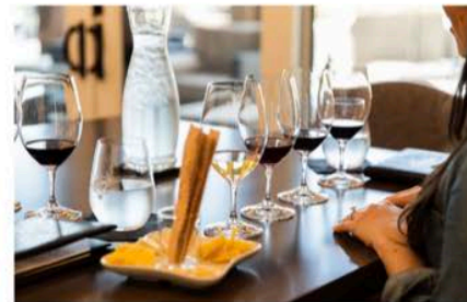
Baldacci Family Vineyards Tasting.

Portfolio Tasting: Begin with a splash of estate-grown sparkling wine prior to a sit-down tasting of estate-grown wines including sparkling, Los Carneros Chardonnay, Los Carneros Pinot Noir, Calistoga Cabernet Sauvignon, and the Black Label Cabernet Sauvignon from Stags Leap District. Includes a seasonal cheese + charcuterie plate. ($75/pp)