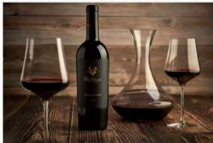
Black Label Cabernet Sauvignon from Stags Leap District.

The family prides itself on the caliber of their portfolio, which ranges from bubbles to Chardonnay to Pinot Noir to single vineyard Cabernet Sauvignon. They also craft an award-winning late harvest Gewürztraminer.